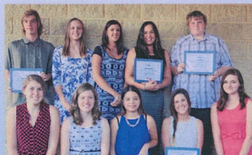
10 of the 16 grant recipients 2014